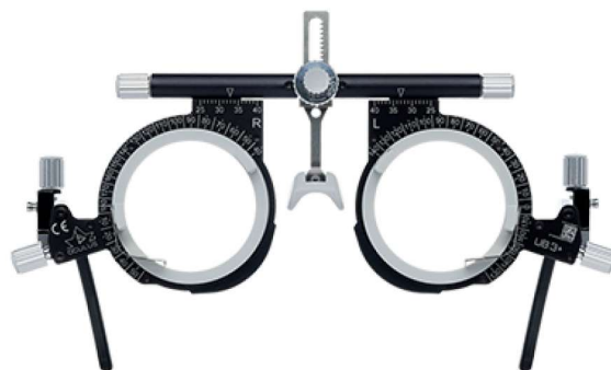
Universal Trial Frame OCULUS UB 3+