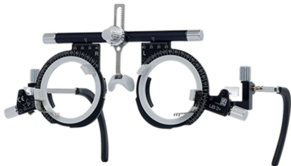
Universal Trial Frame OCULUS UB 3+