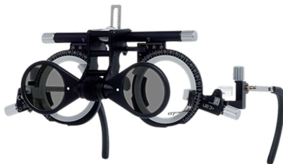
Universal Trial Frame OCULUS UB 3+ with Hegener reversible polarizing filter

The optional Hegener reversible polarizer is mounted directly onto the Universal Trial Frame.