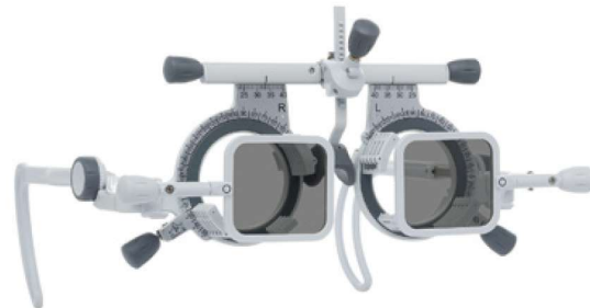
Universal Trial Frame OCULUS UB 6 with optional reversible polarizer

The trial frame is one of the tools of the trade for every refraction professional. Subjective lens determination requires craftsmanship and manual skill. Your professional competence will be perfectly demonstrated with the new Universal Trial Frame UB 6. In the new product development of the UB 6 we put ergonomics, simple handling and optimal wearing comfort front and center.