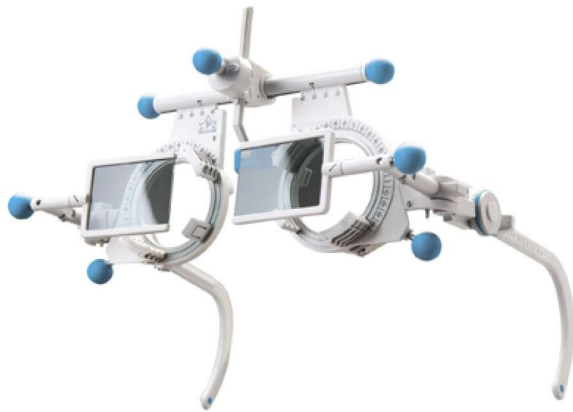
Universal Trial Frame OCULUS UB 4 with optional reversible polarizer